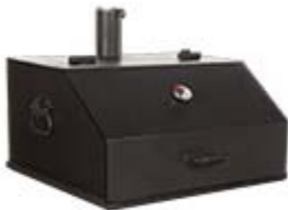
Lid Firebox 2,4,5

Image on left is a Firebox 4 on a stand with a Lid for Firebox 4 on it.