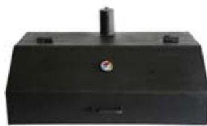
Lid Firebox 3